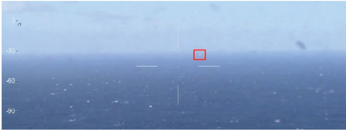
Wide Area Surveillance