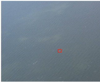
Small Object Detection

AUTOMATED OBJECT DETECTION FOR FULL MOTION VIDEO