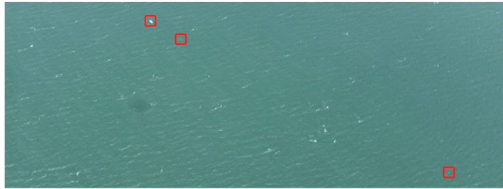
Search and Rescue